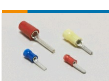
Crimp Wire Pins, Tabs & Ferrules (4)