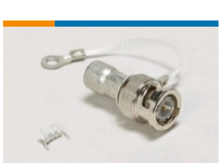
Coax Terminators (16)