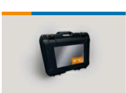
Fiber Termination & Tool Kits (1)