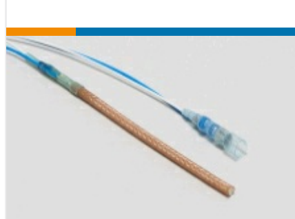
Coax Cable Termination (41)